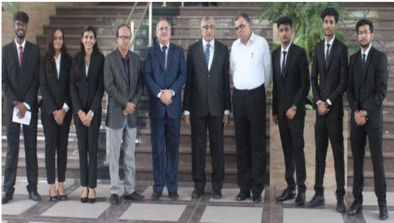
(The Student Council and Organising Committee with Dignitaries)